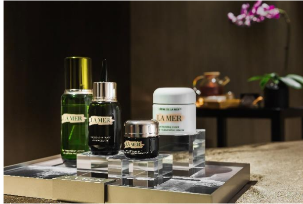
LA MER products

skin care tools, will enable guests to tap into the power of the deep sea to revitalise the skin and enhance its self-healing properties.