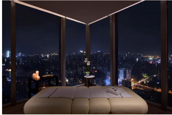
The Spa at Niccolo Chongqing

11 January 2023 (Chongqing, China) – Niccolo Chongqing collaborates with LA MER to launch a luxury rejuvenating experience at The Spa. The Spa de La Mer takes guests on an opulent journey through time, triggering the healing power of the six senses, and allowing the skin to heal itself from the inside out.