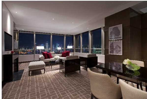
Discovery Suite at Niccolo Chongqing

Escape the hustle and bustle of the city with a relaxing and pampering stay at Niccolo Chongqing's chic sky-high retreat. The Spa De Lamer suite package priced at RMB 4,588 per night in Explorer Suite, RMB 5,588 per night in Discoverer Suite and valid for stays from now to 29 June, 2023. The package offers: daily skyline breakfast for two, Happy Hour at Bar 62, an extra 60-minute Spa De La Mer facial treatment for two, Niccolo Insider personal shopping assistance, late checkout and other exclusive services. Besides that, Book N2 Grand River View Room and above room type at best available rate to enjoy Spa De La Mer credit of RMB500 for one.