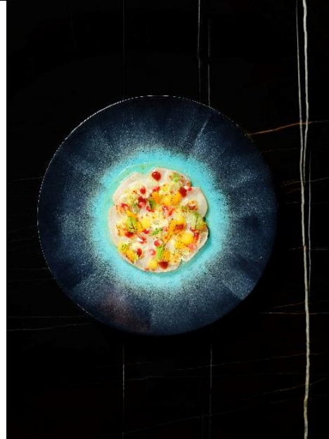
The Tai Pan – Christmas _ Blood Orange & Vodka Cured Hamachi