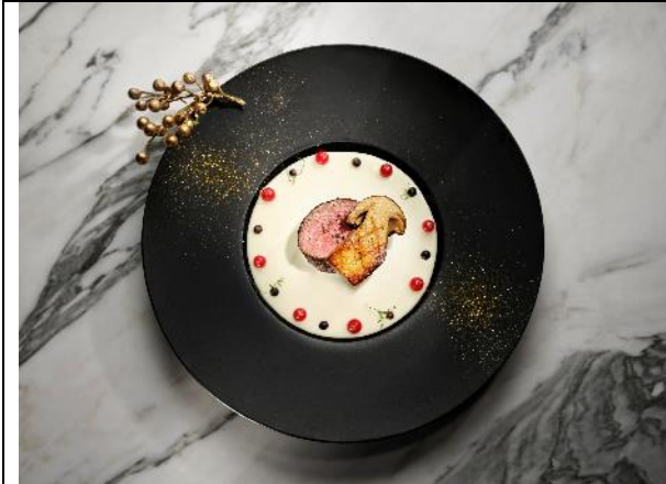
Popinjays – Christmas Grand Veneur Wild Venison