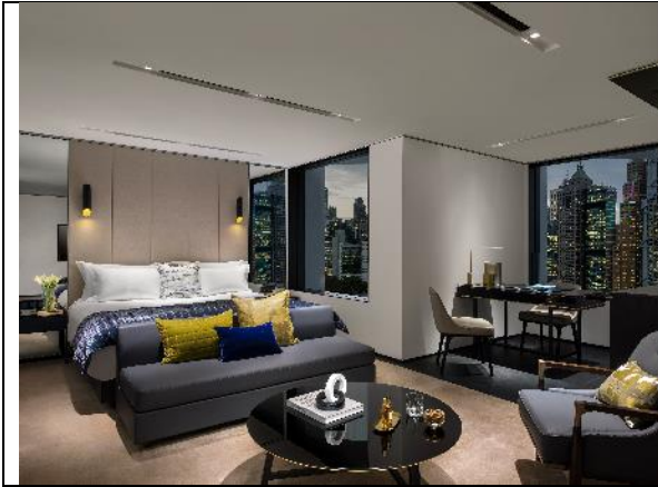
The Murray - Grand Deluxe Room (Night City View)