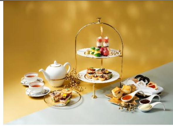
Garden Lounge – Festive Afternoon Tea