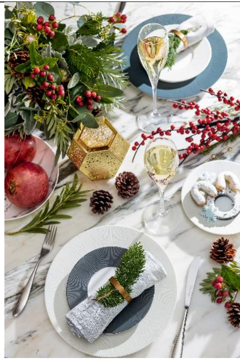
Popinjays - Festive Brunch