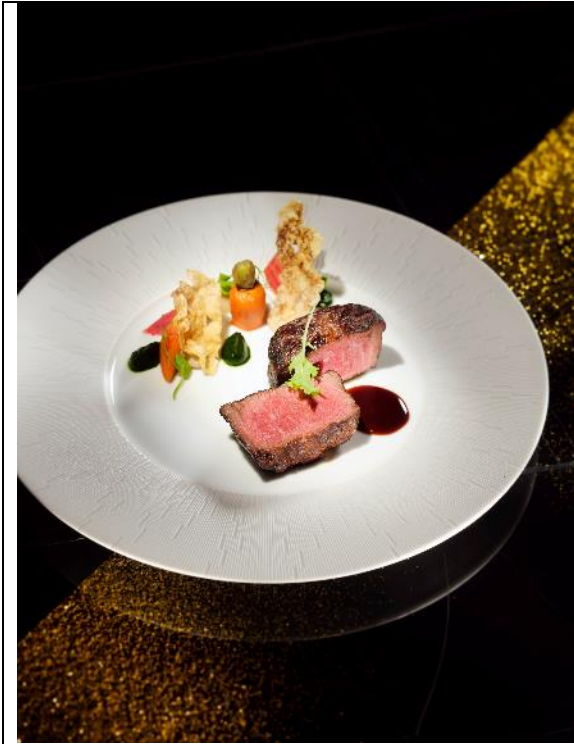
The Tai Pan – Christmas Grilled Prime Beef Tenderloin