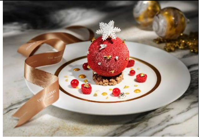
The Tai Pan – Christmas Winter Berries & Mascarpone Cheese Sphere