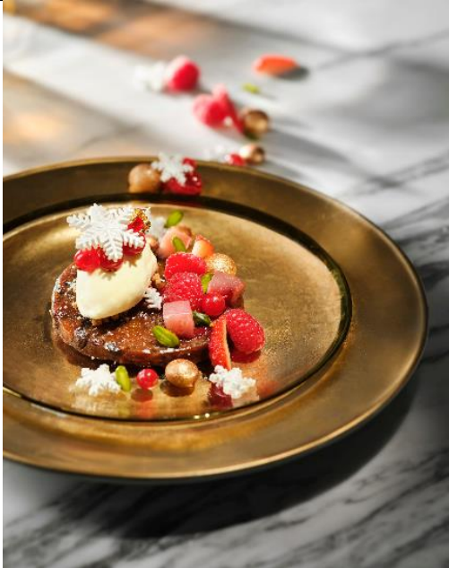
Popinjays- Christmas Christmas Pudding, Winter Fruits, Madagascar Vanilla Gelato