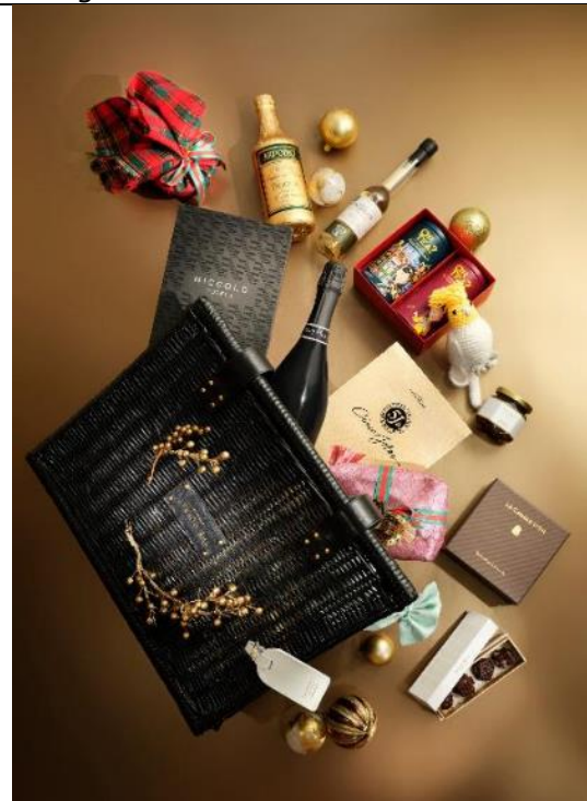
The Murray Hamper