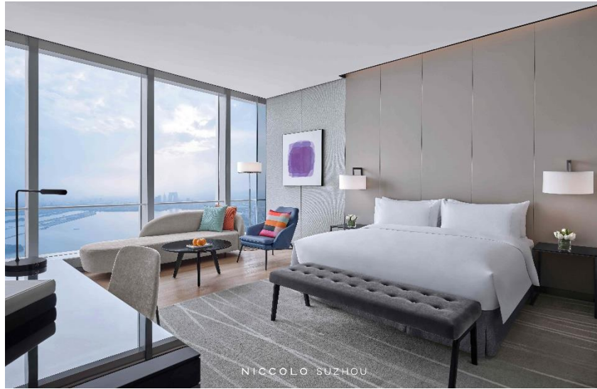
N2 Lake View Room

The next morning, enjoy a semi-buffet breakfast at Niccolo Kitchen on the 115th floor. Showcasing Eastern and Western cuisine, Niccolo Kitchen is a culinary theatre where chefs present their authentic cooking styles and tastes. Niccolo Kitchen offers local and international delicacies and a spectacular skyline view. Wake up, and vitalise your skin by enjoying a delicious meal here.