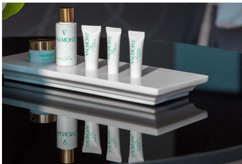
Valmont Limited Edition Travel Kit

The Valmont Limited Edition Travel Kit includes five popular products, including a cleanser, a moisturiser, an eye care product, a lip care product and facial cream. Adhering to the brand concept of "When art meets beauty", the products are designed to show the concept of Swiss nature and purity to guests.