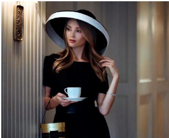
Niccolo Hotels New Encounters Timeless Pleasures