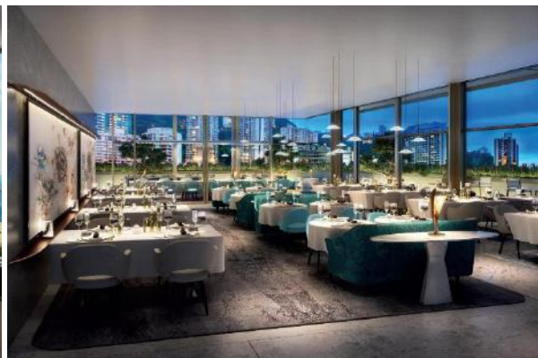
Popinjays, The Murray, Hong Kong, a Niccolo Hotel