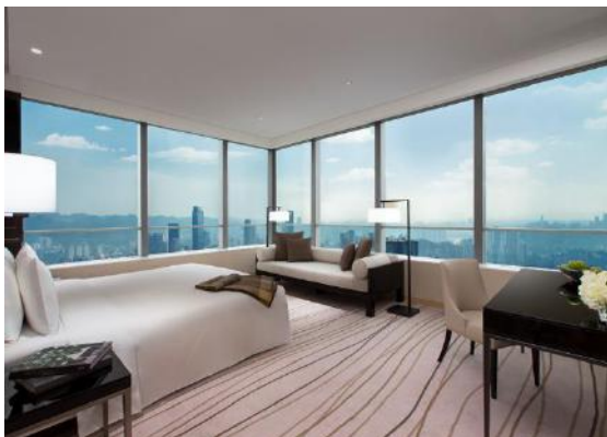
N3 Grand Deluxe, Niccolo Chongqing