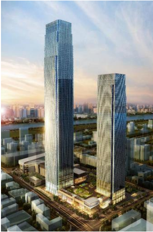
Exterior, Niccolo Changsha